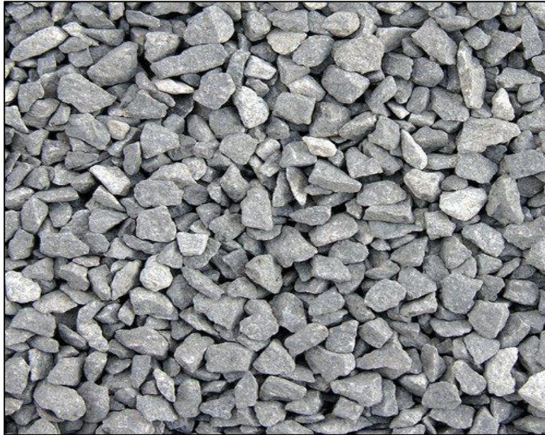
Fig. no. 3 Natural Aggregates