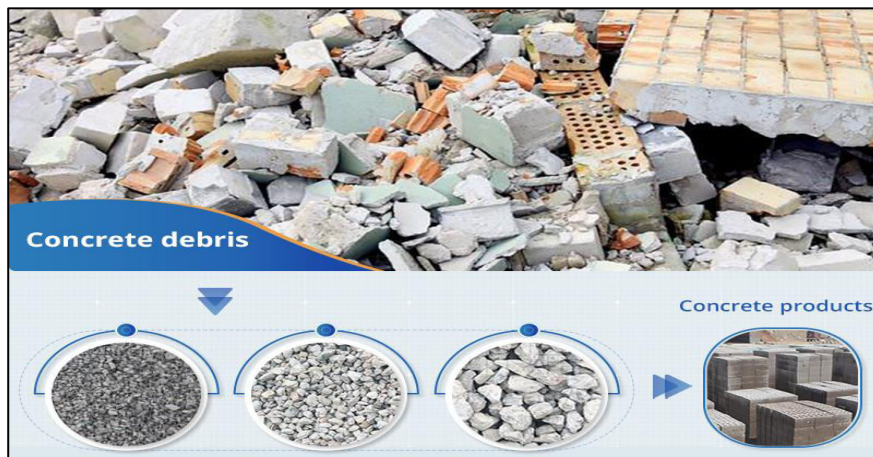
Fig. no. 1 Recycled Aggregate Concrete Formation