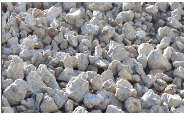
Fig. no. 2 Recycled Aggregates